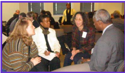
Participants engaged in dialogue during an Alliance event

This research confirmed that there was under-representation of people of color in leadership positions. Anecdotal stories confirmed that it was across the board – in the public sector, in corporate America and in non-profits. It became obvious that neighborhoods in which community development corporations (CDCs) worked had become increasingly of color, yet the leadership of CDC's remained white.