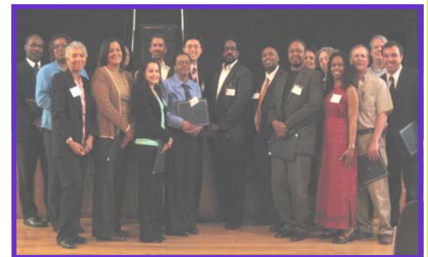
2005-6 Mentoring Program participants at the May 2006 end of the year celebration